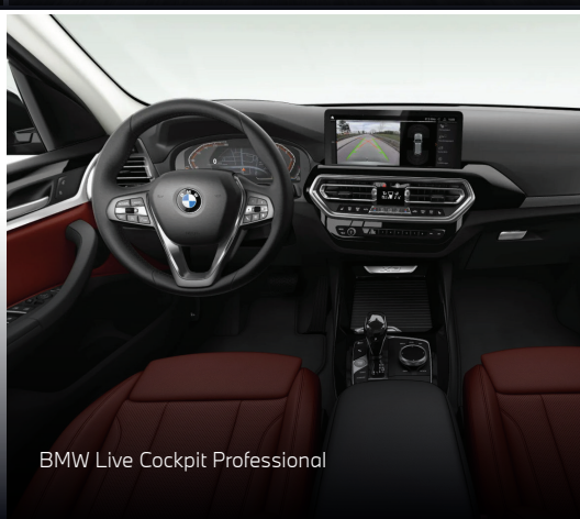
BMW Live Cockpit Professional