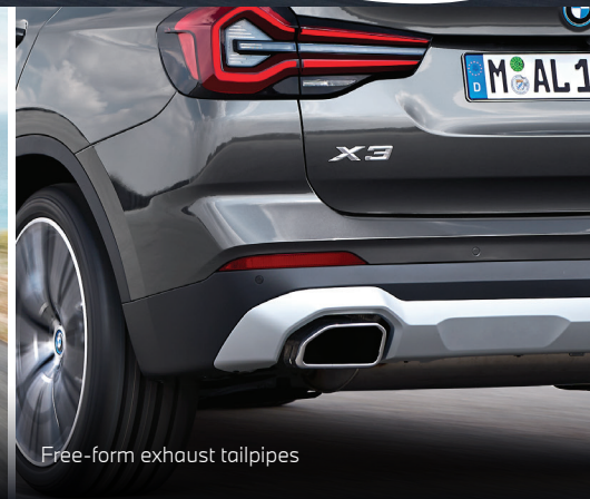
Free-form exhaust tailpipes