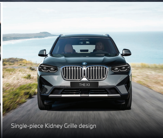
Single-piece Kidney Grille design