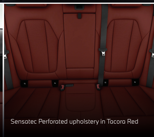
Sensatec Perforated upholstery in Tacora Red